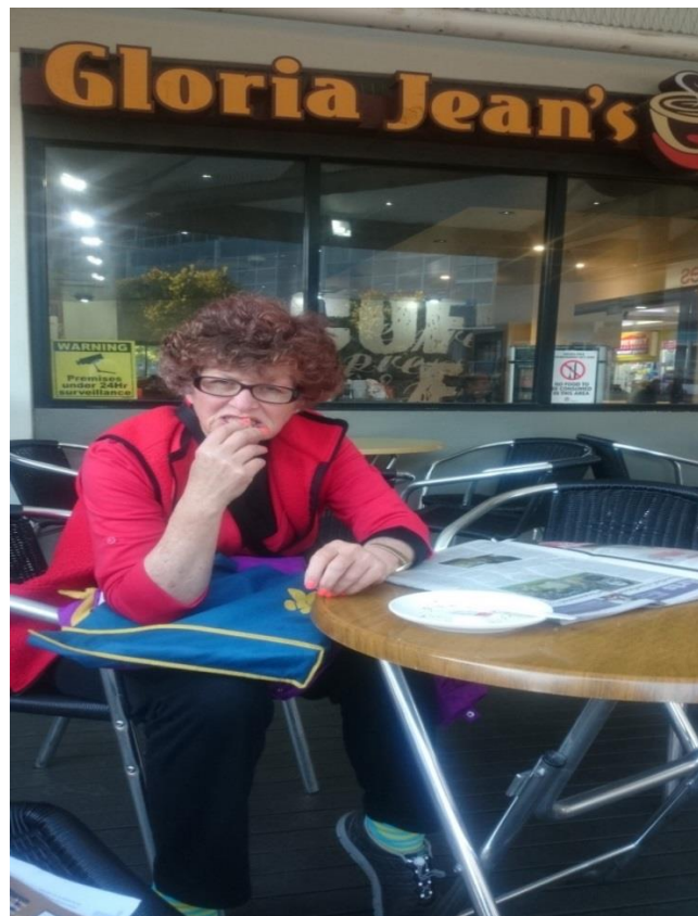
A VERY NAUGHTY PIECE OF TOAST DEFYING A “NO FOOD TO BE CONSUMED” SIGN OUTDOORS.

Victoria is finally considering smoke-free outdoor dining, and several health groups have combined to call for sensible, non-confusing concurrency with smoke-free outdoor drinking. The response so far is quite negative, but we will continue the call for this positive, healthy and timely change. Smoke-free outdoor drinking is also overdue in other States.