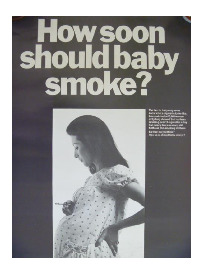
Old poster, sadly a current problem.