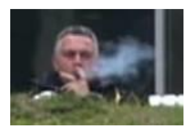
Joe, we need a bigger Tobacco Control BUDGET!! (SMHpic)

Annual excise/revenue from tobacco is between $7billion and $9 billion but the officially agreed economic and social costs total approximately $31billion – we need to spend more on helping smokers to quit, meanwhile protecting everybody by declaring tobacco smoke as a toxic air contaminant. There are still approximately 2,800,000 smokers – that's an awful lot of poison to avoid.